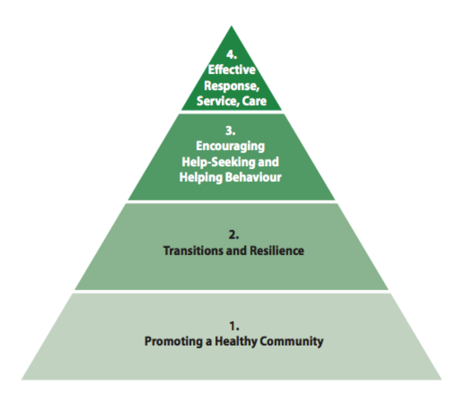
Appendix 3 – Pyramidal Approach to Mental Health from Queen's University

Source: Principal's Commission on Mental Health. (2012, November). 'Student Mental Health and Wellness FRAMEWORK AND RECOMMENDATIONS FOR A COMPREHENSIVE STRATEGY' (Rep.).